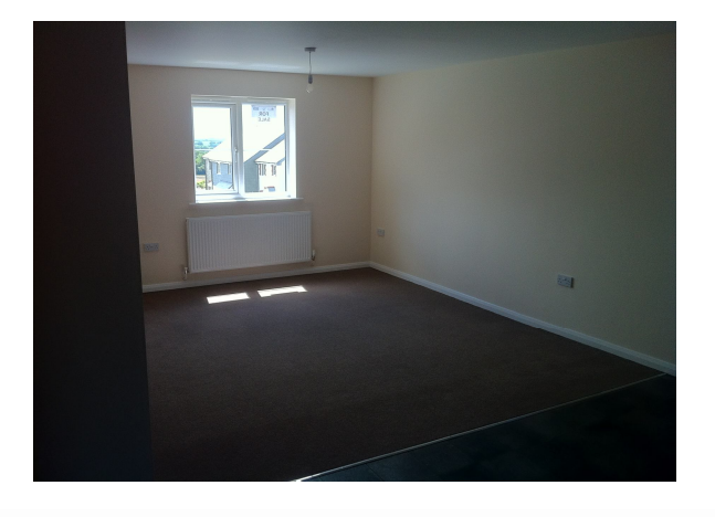
Homes to be proud of that won't cost the earth